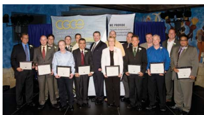
2009 University of Nevada, Reno graduates who earned their credits at the Canadian Gaming Education Forum.